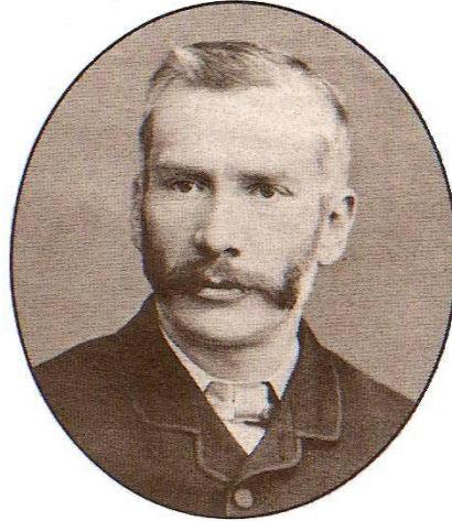
A photograph of Jesse Boot